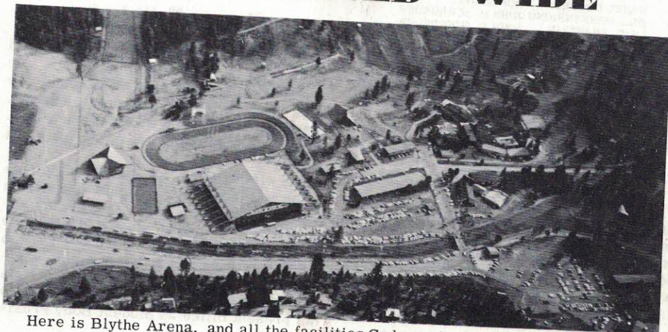
Here is Blythe Arena, and all the facilities God supplied at Squaw Valley!